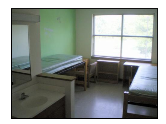
Residential Dorm Room

GSSM's housing accommodations are suites, which are located on the second, third, and fourth floors of our Daniels Resident Hall and our Neilson Resident Hall. Each room of the suite is connected by a shared bathroom. The residential floors are accessible by elevator, and there are handicapped accessible rooms for those with limited mobility.